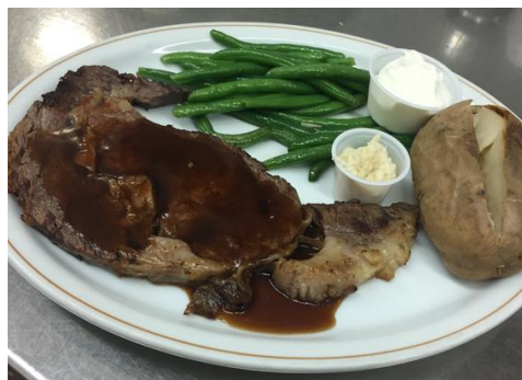
Prime Rib with fresh vegetables and a baked potato

(Comes with fresh vegetables, choice of potato and soup or salad to start.)