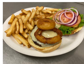
Firemen Burger with fries

Our lean ground beef burger topped with Swiss cheese, cheddar cheese, sauteed mushrooms & bacon. 14.49