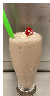
Chocolate Caddy Shake

Coffee 2.19 Tea 1.99 Premium Tea 2.69 Pop 2.79 Juice 2.19 Tomato Juice 2.49 2 % Milk / Chocolate Milk 3.29