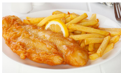
Captian Hook's Fish

Lightly battered cod served with coleslaw, tarter sauce and lemon. 1pc 12.99 or 2pc 15.99